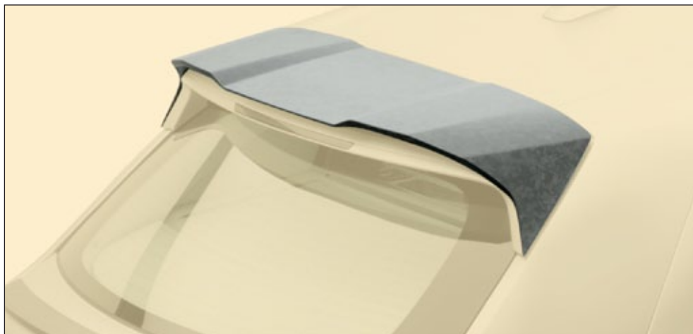
Roof spoiler - exposed ..... RRC 630 771 visible carbon fibre glossy*