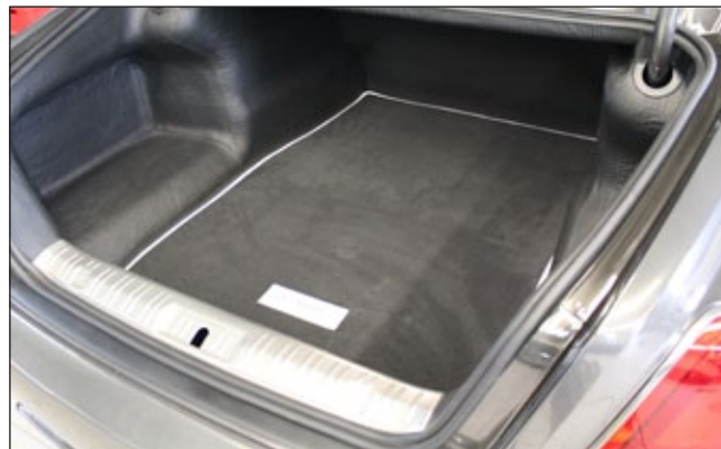
Trunk mat RRC 368 758 with logo stitch