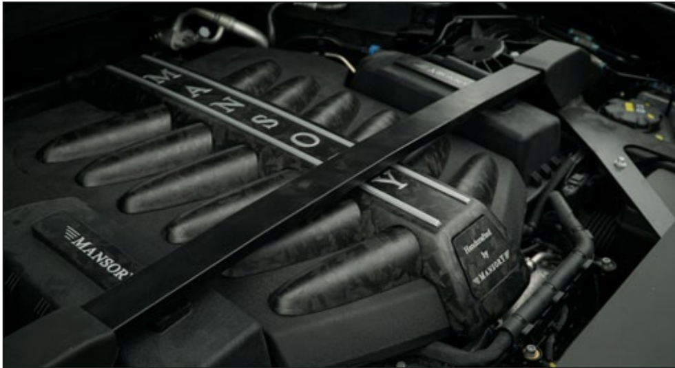
Engine cover with MANSORY logo