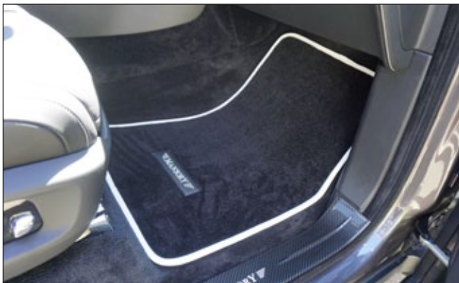
Floor mats RRC 367 758 4 parts, front/ rear, left/ right with logo stitch