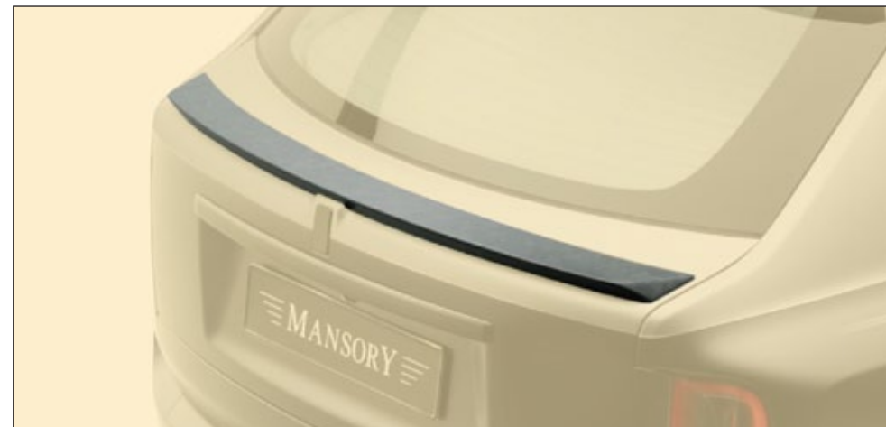
Rear decklid spoiler - exposed ..... RRC 830 841 visible carbon fibre glossy*