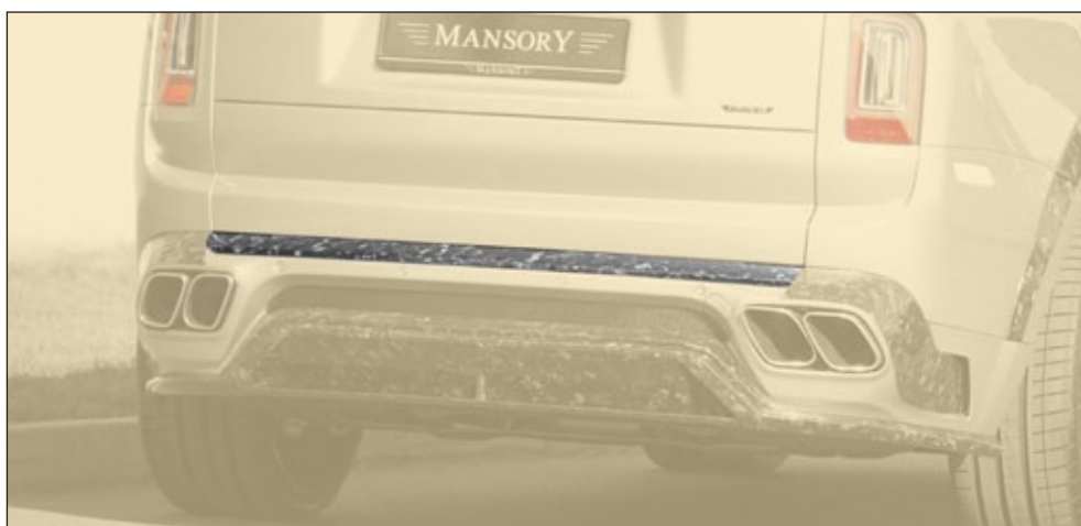
Rear bumper protective bar ..... RRC 802 714 visible carbon fibre glossy*