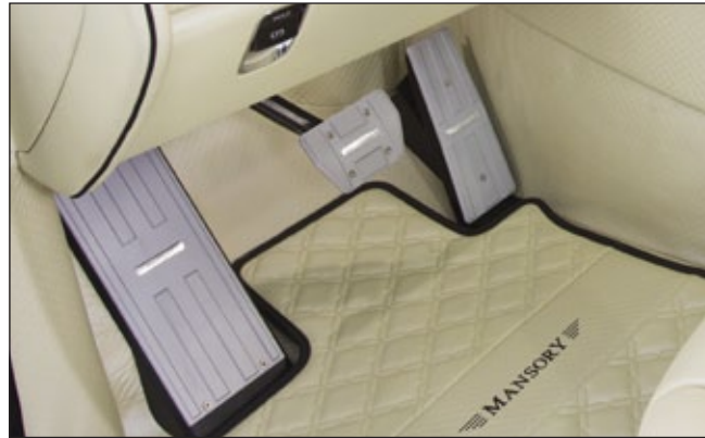
Sport pedals RRC 367 127 3 parts, acceleration, brake, foot rest