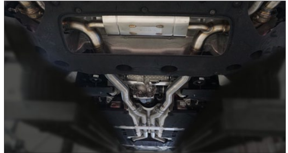
Sport Exhaust System for Wide Body