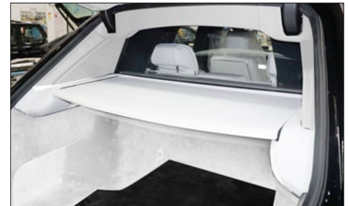
Trunk house decor RRC 368 500 Complete refined trunk compartment, by exclusive leather sorts, combination on customers request.