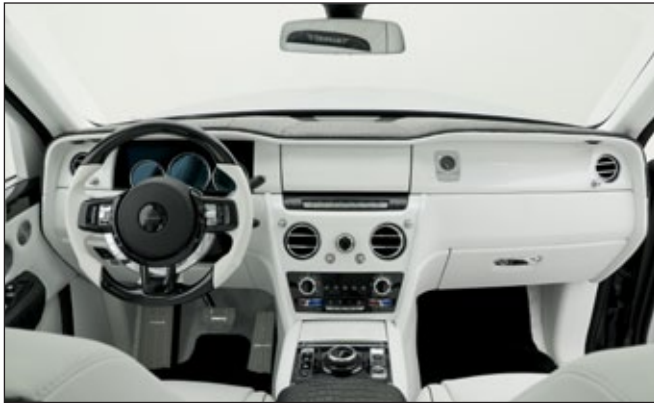
Interior trims RRC 300 001 set instrument panels, cockpit & front middle console tunnel covers. available with carbon and wood ⚠ modification only, OE-part required