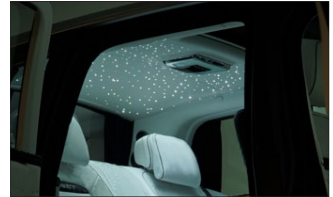
Headliner RRC 390 000 ⚠ modification only, OE-part required