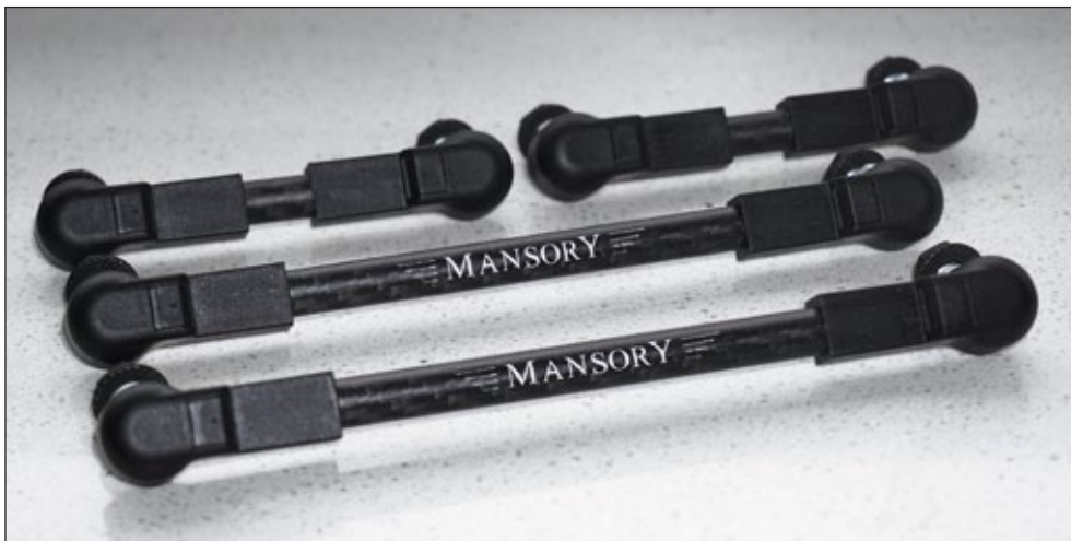
MANSORY Lowering Suspension for Rolls Royce Cullinan